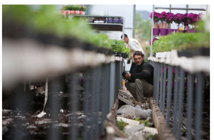
In Kosovo young people are given realistic training exercises to prepare them for employment.

Employment and income, which is one of the SDC's priority themes, focuses the work of the agency on economic aspects, in particular financial-sector development, the private sector, and vocational education and training. In the Western Balkans, projects and programmes are concentrated on promoting the private sector and vocational education and training. The SDC supports concrete activities and the implementation of reforms to enable the local population to enjoy better working conditions and higher incomes.